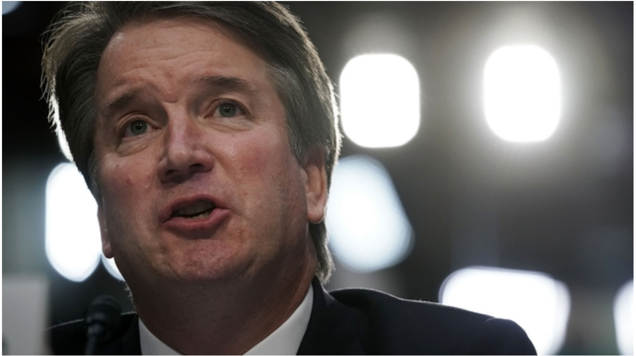
Supreme Court nominee Judge Brett Kavanaugh testifies before the Senate Judiciary Committee on the third day of his Supreme Court confirmation hearing on Capitol Hill September 6, 2018 in Washington, DC.