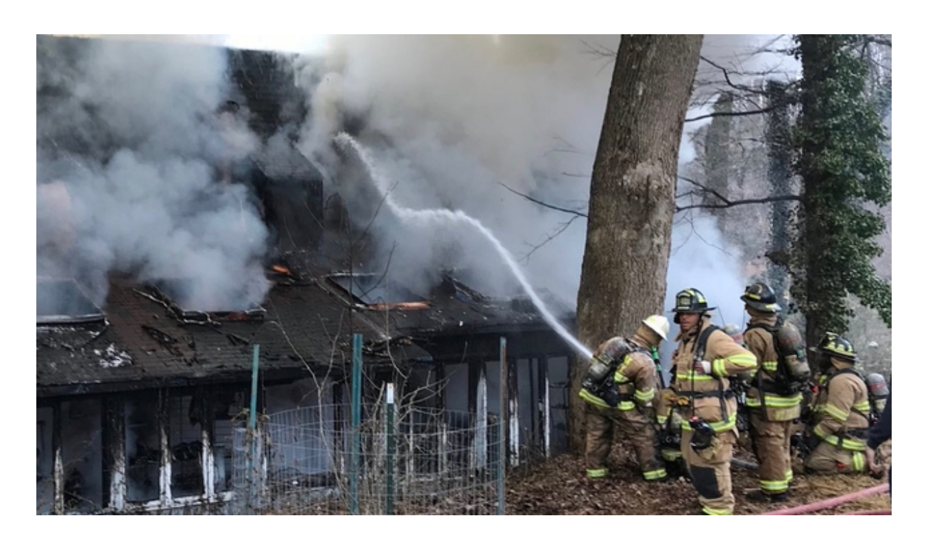
MCLEAN, Va. (FOX 5 DC) - One person is dead after a fire in the McLean area on Saturday afternoon.

POSTED MAR 09 2019 04:09PM EST VIDEO POSTED MAR 09 2019 07:35PM EST UPDATED MAR 09 2019 08:33PM EST