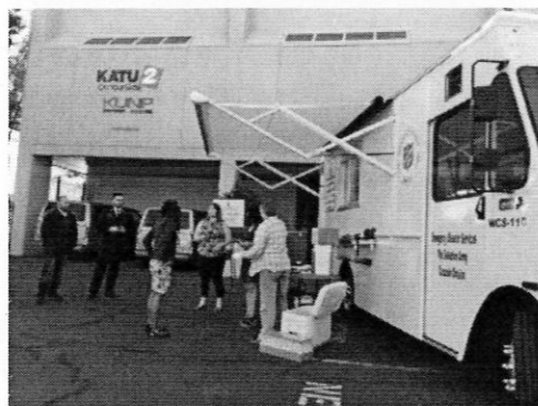
KATU of Portland, OR collected donations as part of Sinclair's company-wide effort