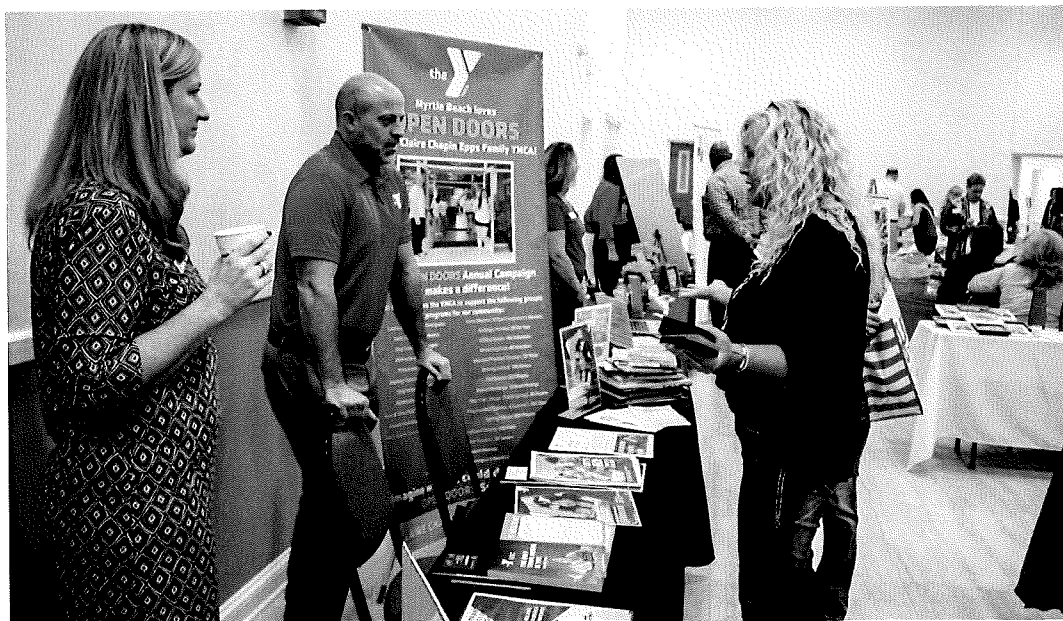
YMCA of Coastal Carolina exhibits at the 2022 Nonprofit Expo

Free Event at The Hangout to Feature Over 40 Exhibiting Organizations