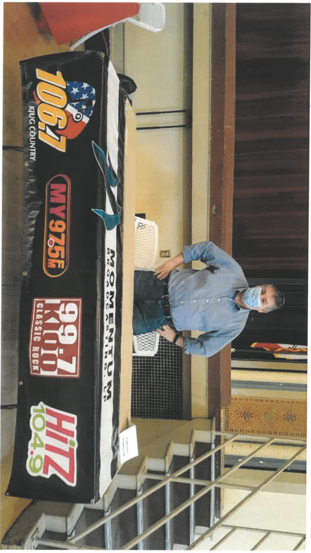
Kings County Job Fair 9/9/2021