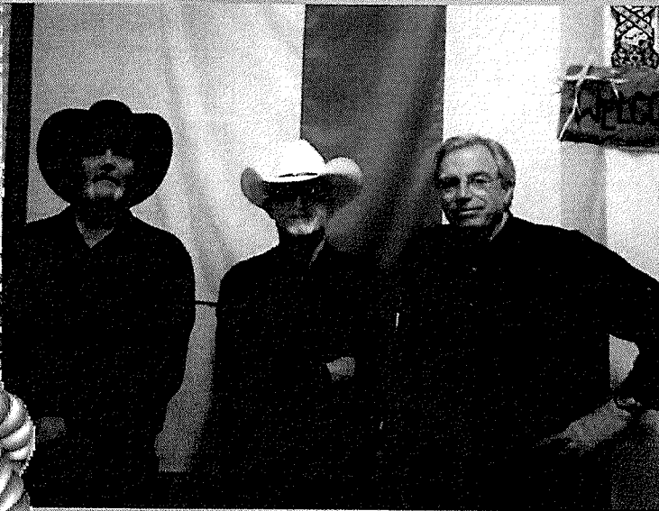
The Ragland Trio

(Advance ticket sales now at VFW Post 4694 available at normal business hours for $12.50)