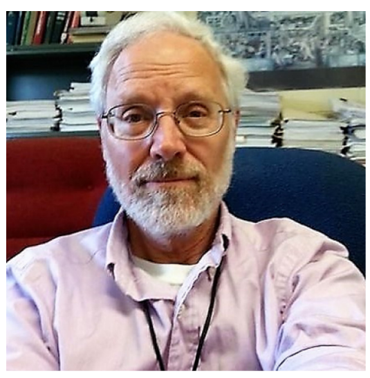
Ohio Citizen Action