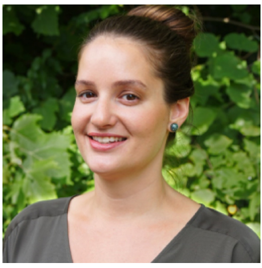
Ohio Citizen Action