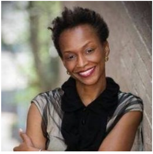
Environmental Justice / Ohio Citizen Action