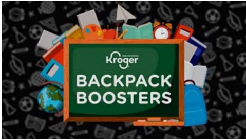
KROGER BACKPACK BOOSTERS