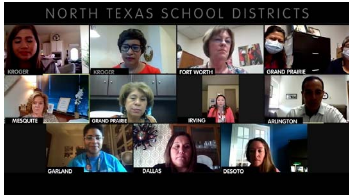
BACKPACK BOOSTERS THANK YOU