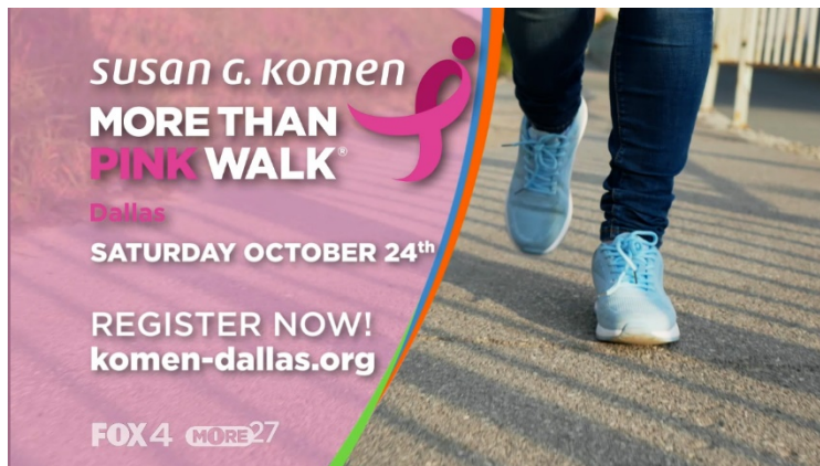
KOMEN VIRTUAL “MORE THAN PINK” WALK