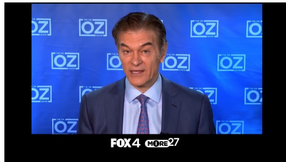
HAROLD HAMM FOUNDATION –PSA's with Dr. Oz and Oklahoma Coach Barry Switzer/Diabetes Prevention