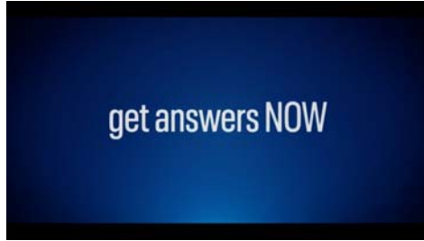
FIGHT THE SPIKE/QUESTIONS