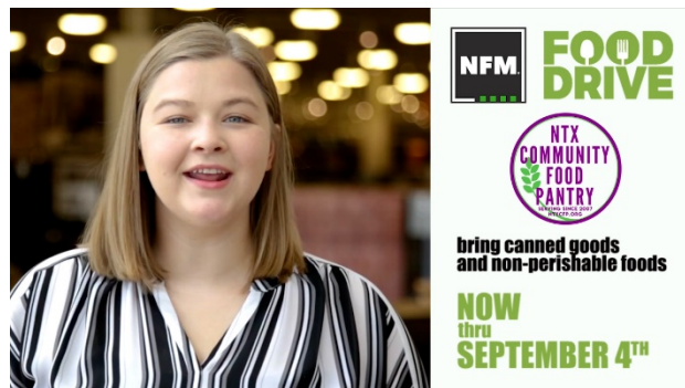
NFM FOOD DRIVE – “BE ONE AGAINST HUNGER”