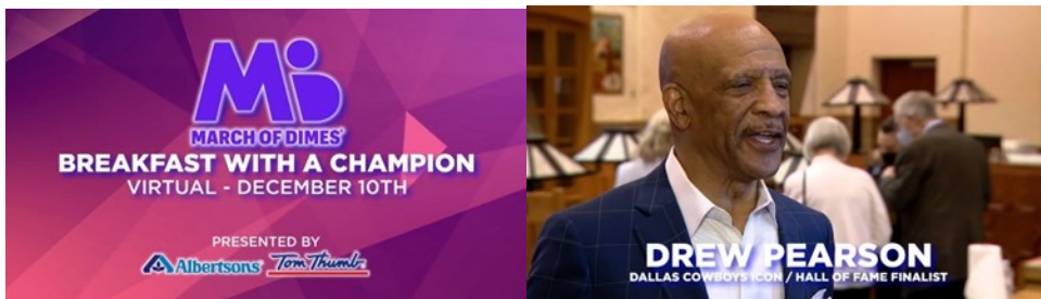
MARCH OF DIMES BREAKFAST WITH A CHAMPION 2020