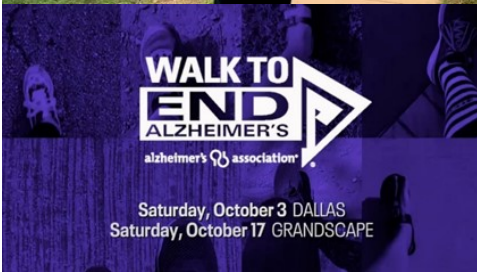
ALZ WALK 2020