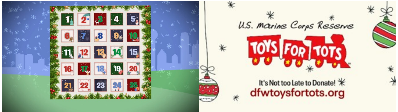
US MARINE CORP TOYS FOR TOTS 2020