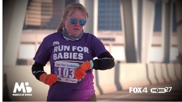
MARCH OF DIMES RUN FOR BABIES 2020