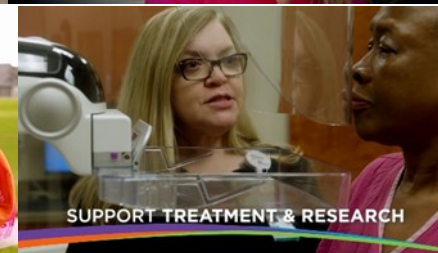
SUSAN G. KOMEN RACE FOR THE CURE 2020