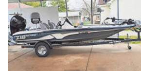
2019 Nitro Z18 Pro Bass Boat w/Mercury 150XS w/ stainless prop, Minnkota Forlex, foot control, 12/24 volt trolling motor, Lowrance on board, hook 5, navigation & mapping system. Digital stereo, hot foot, swing out flr. This boat is loaded! I am a disable veteran. Asking $2500 & take over payment 3/28/15. Call: 931-364-4213