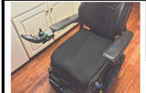
Corpus M3 Power chair with seat lift, Like new, only used inside., $5,500.00. (615)810-2643 carterjacl2@gmail.com

Couch, Haverty's 90 inch 3 cushion Tan like new, great condition. Reduced to, $225.00. (615)569-6608