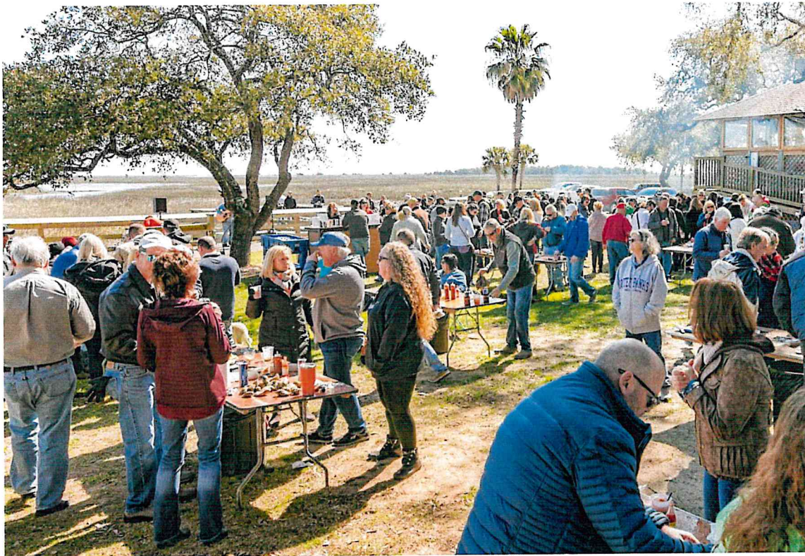
PICTURED: The annual Shuckin’ on the Strand Oyster Roast is a charitable fundraiser for Grand Strand Young Professionals. Now in its 15 th year, the roast will take place on Feb. 24, 2024, at the Hot Fish Club in Murrells Inlet, S.C.

February 24 charity event to serve Low Country favorites along Murrells Inlet marsh.