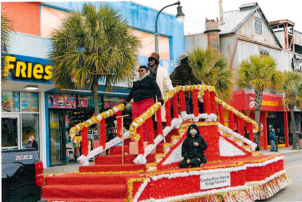
Pictured Above: On Jan. 13, 2024, the MLK Annual Parade is set to step off at 10 a.m. and travel along Ocean Blvd. from 15 th Ave. N to 8 th Ave. N.

Annual MLK Day Parade, Small Business Expo & Community Service Events Scheduled