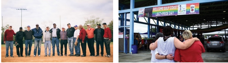
LONG TIME COMING, SOUTHERN PRIDE