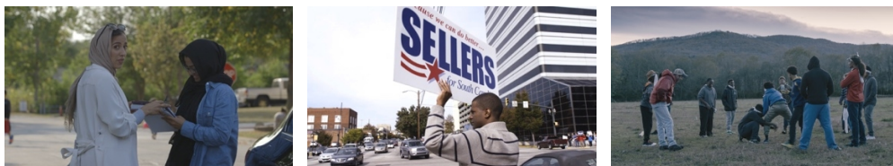
THE FEELING OF BEING WATCHED, WHILE I BREATHE I HOPE, WRESTLE