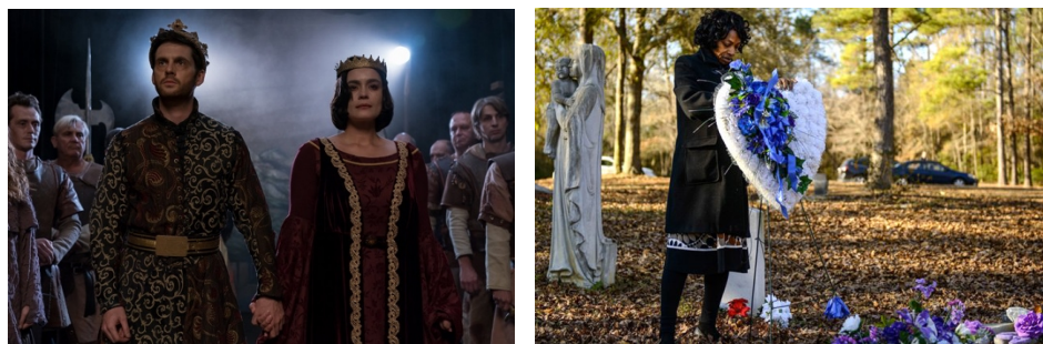
GHOST LIGHT, ALWAYS IN SEASON