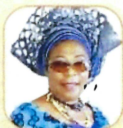
Princess Moradeun Adedoyin-Solarin