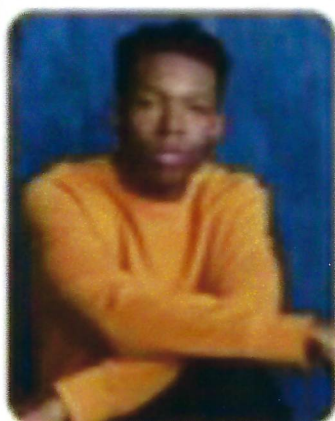
5150 DENZEL WHITAKER Notable Films include Training Day and Black Panther