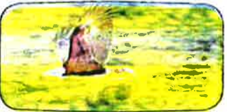
Tanto que apreciamos.