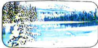
Usted sabe cuanto dependemos de Nuestras Forestas Nacionales?