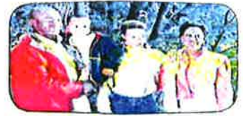
Abrazamos su herencia.