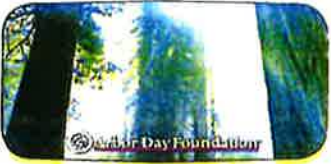
... para replantar Nuestras Forestas Nacionales. Porque mucho depende de lo que hacemos hoy