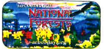
Visite arborday.org . Vea lo que hacemos. Vea como usted puede ayudar.