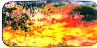
...y fuegos tan calientes que destruyen las semillas del futuro.