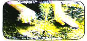
La Fundación Arbor Day Foundation le pide ayuda...