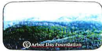
Nuestras Forestas Nacionales ...

También está disponible en :30, :20, :15, :10