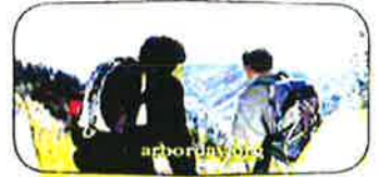
Mucho depende de Nuestras Forestas Nacionales, pero ahora ellas dependen de nosotros.