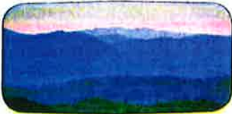
Debemos actuar hoy porque las generaciones del futuro dependen de Nuestras Forestas Nacionales.