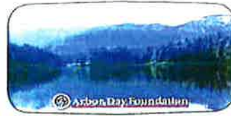
Alabamos su belleza...nos maravillamos ...con su majestuosidad