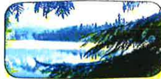
Para aire puro...materiales para el hogar... ...y agua potable para millones de personas.