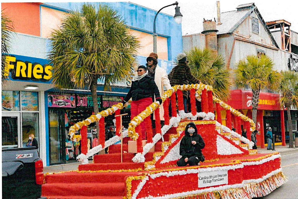
Pictured Above: On Jan. 13, 2024, the MLK Annual Parade is set to step off at 10 a.m. and travel along Ocean Blvd. from 15 th Ave. N to 8 th Ave. N.

Annual MLK Day Parade, Small Business Expo & Community Service Events Scheduled