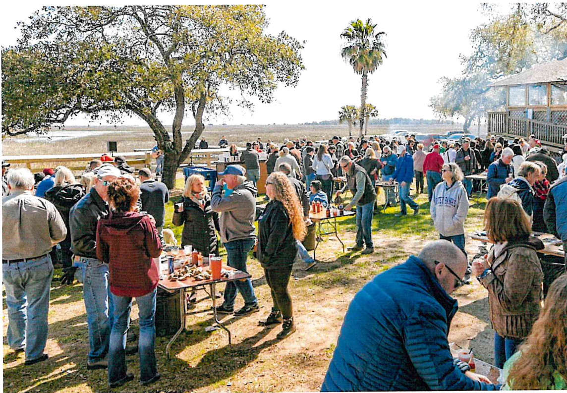
PICTURED: The annual Shuckin' on the Strand Oyster Roast is a charitable fundraiser for Grand Strand Young Professionals. Now in its 15 th year, the roast will take place on Feb. 24, 2024, at the Hot Fish Club in Murrells Inlet, S.C.

MYRTLE BEACH, S.C.—Tickets are now available for the much-anticipated 15 th annual Shuckin' on the Strand Oyster Roast to take place on Saturday, Feb. 24, 2024, from Noon to 4 p.m. at the Hot Fish Club at 4911 Highway 17 Business in Murrells Inlet, S.C.