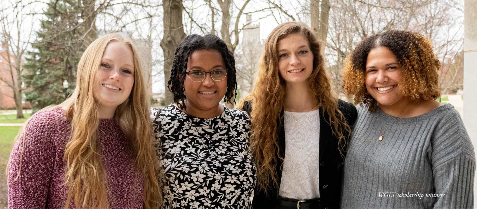
WGLT scholarship winners