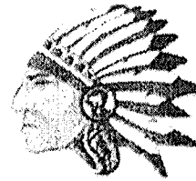
Western Indians (5 games)

Here is your chance to support high school basketball on The Radio!