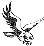
Eastern Eagles (7 games)