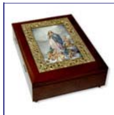
IMMACULATE CONCEPTION MUSIC BOX Item: SPC BOX MB388