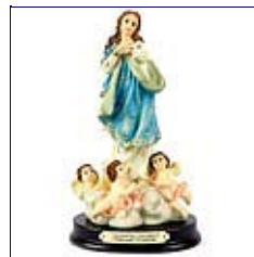
IMMACULATE CONCEPTION STATUE Item: ST MAR FLO 61673