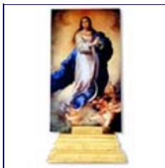
IMMACULATE CONCEPTION PLAQUE Item: ART TB MAR OM275