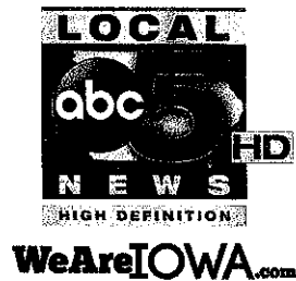
EXHIBIT A Affidavit of Compliance