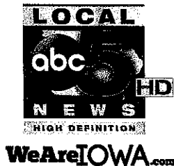
EXHIBIT B Affidavit of Compliance Website Address