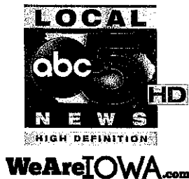
EXHIBIT A Affidavit of Compliance