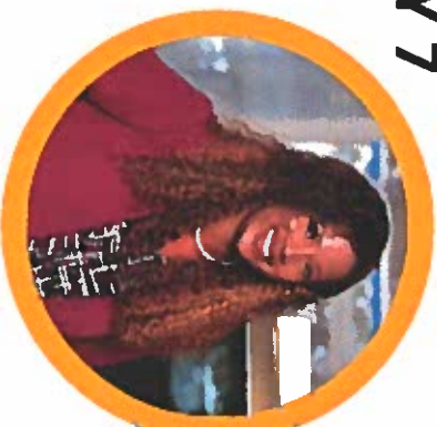
Regina, The Queen of C