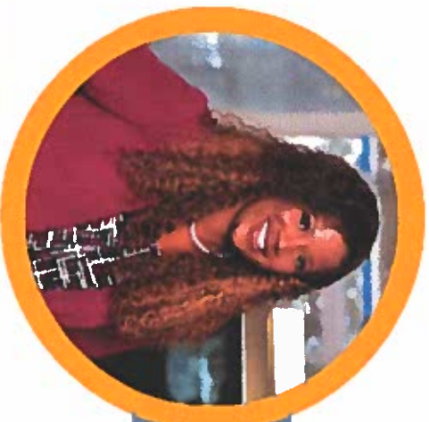
Regina, The Queen of