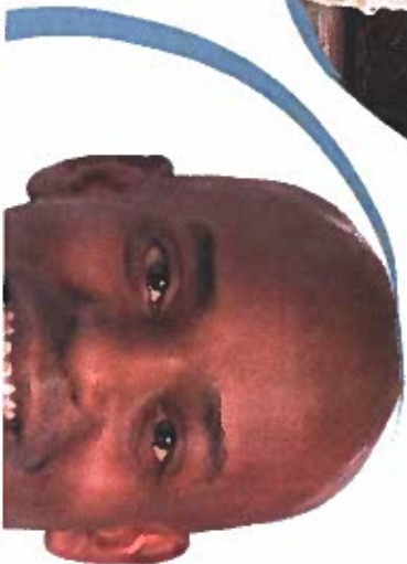
thur White trait Onara