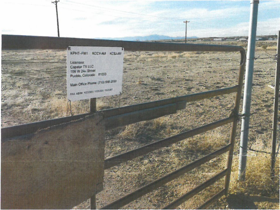
PHOTOGRAPH II (Internal locked gate)