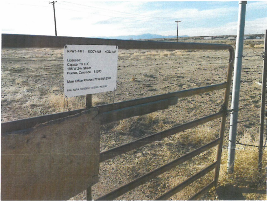
PHOTOGRAPH II (Internal locked gate)