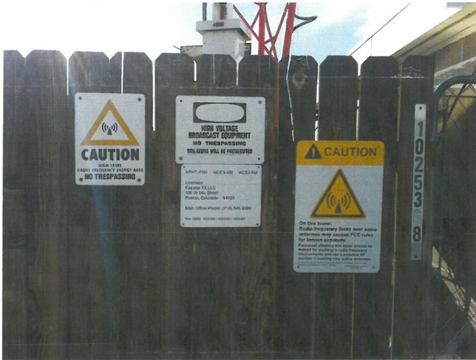
PHOTOGRAPH IV (Equipment Building)