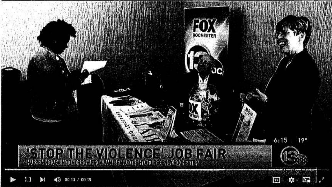
Uniting and Healing Through Hope of Monroe County is hosted this year's Stop the Violence Job Fair on March 28 and March 29.