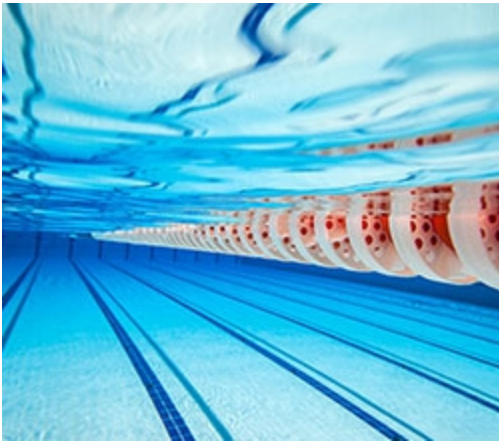
Swimming Pools & Spas