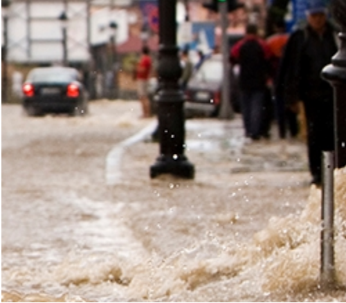
Flood Safety Information