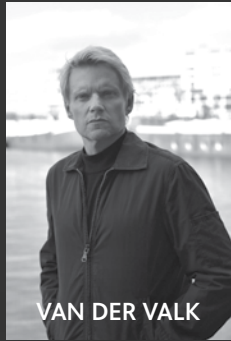
VAN DER VALK