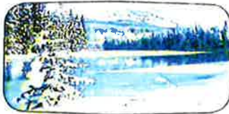
Usted sabe cuanto dependemos de Nuestras Forestas Nacionales?