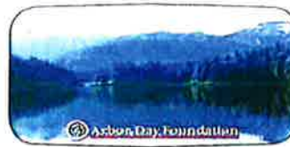
Alabamos su belleza... nos maravillamos ... con su majestuosidad