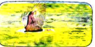
Tanto que apreciamos.