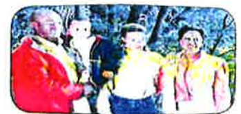
Abrazamos su herencia.