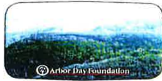
Nuestras Forestas Nacionales ...

También está disponible en :30, :20, :15, :10