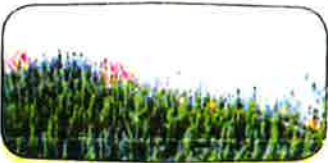
Han sido devastadas por insectos, enfermedad...