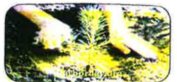
La Fundación Arbor Day Foundation le pide ayuda...