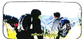
Mucho depende de Nuestras Forestas Nacionales, pero ahora ellas dependen de nosotros.