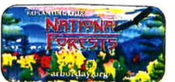
Visite arbor day.org . Vea lo que hacemos. Vea como usted puede ayudar.