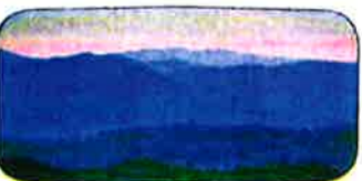
Debemos actuar hoy porque las generaciones del futuro dependen de Nuestras Forestas Nacionales.