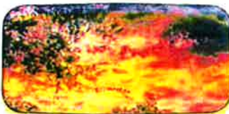
... y fuegos tan calientes que destruyen las semillas del futuro.