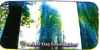
... para replantar Nuestras Forestas Nacionales. Porque mucho depende de lo que hacemos hoy