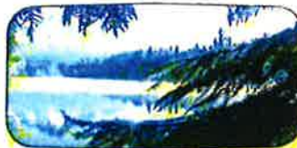
Para aire puro... materiales para el hogar... ... y agua potable para millones de personas.