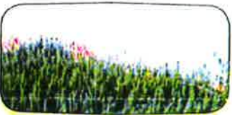
Han sido devastadas por insectos, enfermedad...