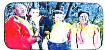
Abrazamos su herencia.