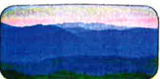
Debemos actuar hoy porque las generaciones del futuro dependen de Nuestras Forestas Nacionales.