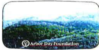
Nuestras Forestas Nacionales ...

También está disponible en :30, :20, :15, :10