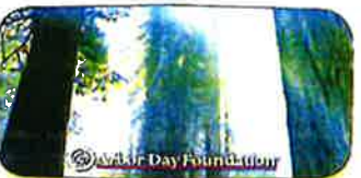
... para replantar Nuestras Forestas Nacionales. Porque mucho depende de lo que hacemos hoy.