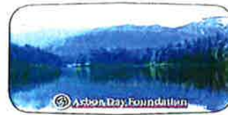
Alabamos su belleza... nos maravillamos ... con su majestuosidad