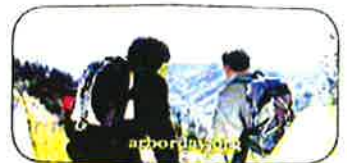
Mucho depende de Nuestras Forestas Nacionales, pero ahora ellas dependen de nosotros.