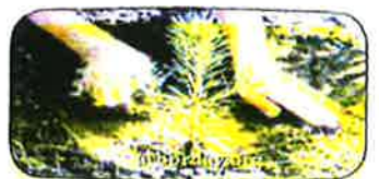
La Fundación Arbor Day Foundation le pide ayuda ...