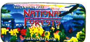
Visite arborday.org . Vea lo que hacemos. Vea como usted puede ayudar.