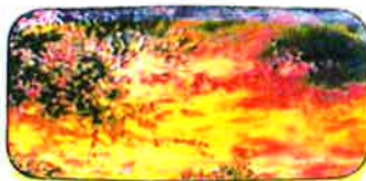
...y fuegos tan calientes que destruyen las semillas del futuro.