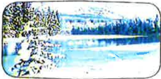
Usted sabe cuanto dependemos de Nuestras Forestas Nacionales?