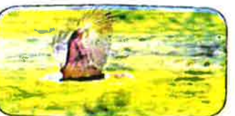
Tanto que apreciamos.