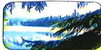
Para aire puro... materiales para el hogar... y agua potable para millones de personas.