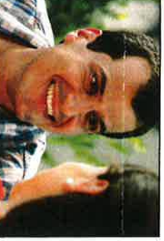
ESPOSO: ¿Y cuándo comenzamos?