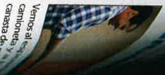
Ventos al... camioneta y a... cajista de pro...