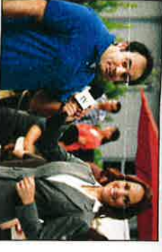
CLIENTE: Esta es la quinta vez que vengo en dos días... ¡este pollo me ha cambiado mi vida!