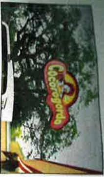
ESPOSA: sí, sí... Y luego crecemos... Y sería un restaurante a todo dar... ¡Con nombre!