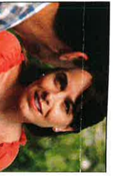
ESPOSA: Apenas nos alcanza para la hipotec...