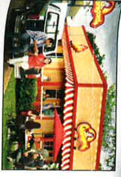
ESPOSO: ¡El Cocorogordo! ¡Con un cartel enorme! ESPOSA: Y nos haremos famosos.