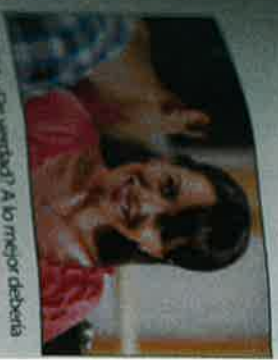
ESPOSA: ¿De verdad? A lo mejor debiera ser un restaurante.