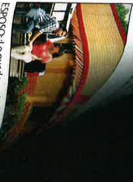
ESPOSO: ¡lo puedo veri! Vemos cómo la casa comienza a transformarse en el restaurante de sus...