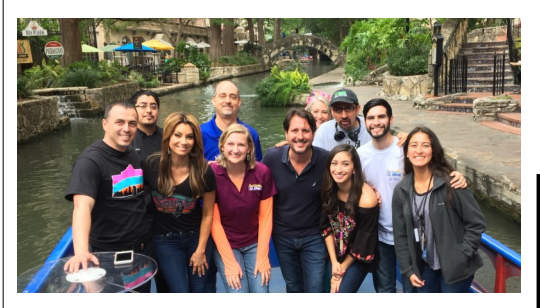
The Daytime@Nine crew broadcast LIVE from a River Walk Barge, part of a special week of Fiesta shows.