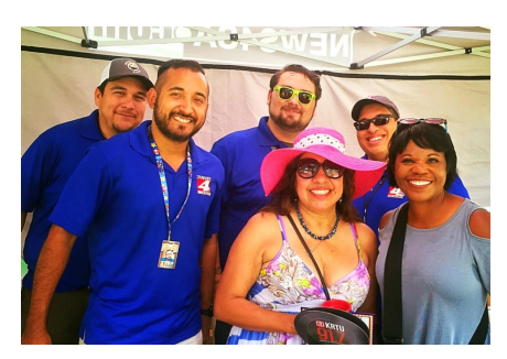
Station Booth at 2016 JazzSAlive event