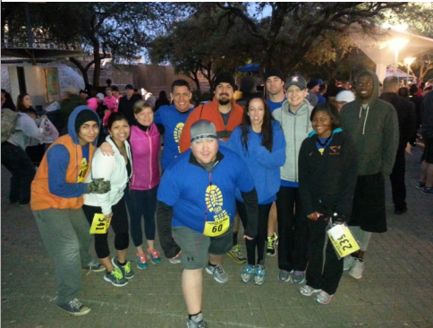
Sinclair team ready to tackle the Cystic Fibrosis Tower Climb