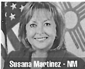
Susana Martinez - NM