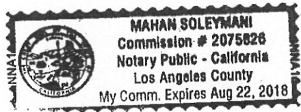
Place Notary Seal Above

Signature [Signature] Signature of Notary Public