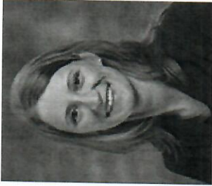
Senior Vice President Communications