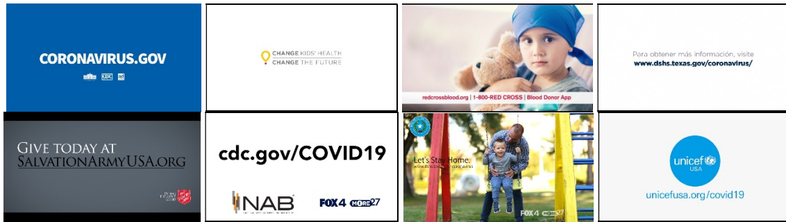
The stations also aired several Coronavirus-related public service announcements provided by various agencies.