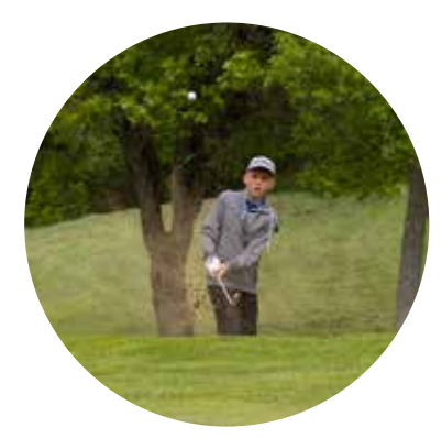
Boys & Girls State Golf Tournament in Watertown, Rapid City & Pierre June 5 & 6

Check out highlights and photos at SDPB.org/softball