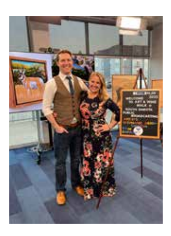
We had a great time hosting a stopping point on the Downtown Sioux Falls Art & Wine Walk.