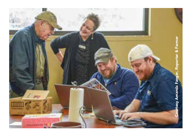
The 25th Anniversary Season of Dakota Life has ended. Thank you to everyone who stopped by at the premiere screenings, watched at home, and shared with friends. See you next season when we feature nine more South Dakota communities!